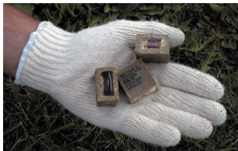
Fishmeal polymer bait

The fall baiting operation typically includes all of the counties along the entire eastern border of Ohio, along with counties in Pennsylvania and West Virginia. The purpose of the routine fall ORV baiting is to maintain the 25-mile-wide immune barrier along Ohio's borders with Pennsylvania and West Virginia. All or parts of 14 counties (Ashtabula, Belmont, Carroll, Columbiana, Cuyahoga, Geauga, Harrison, Jefferson, Lake, Mahoning, Monroe, Portage, Summit, and Trumbull) will be baited during the Fall ORV Program. Approximately 772,686 fish meal polymer baits will be distributed by hand, by helicopter and by fixed-wing aircraft throughout these counties.